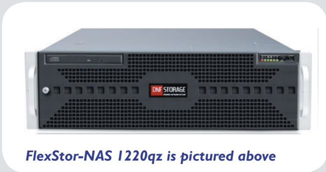
FlexStor-NAS 1220qz is pictured above

Dynamic Network Factory's FlexStor-NAS MidRange Systems are the foundation of a reliable and scalable file server solution. Each FlexStor-NAS MidRange system has an ideal blend of size and storage capacity for the