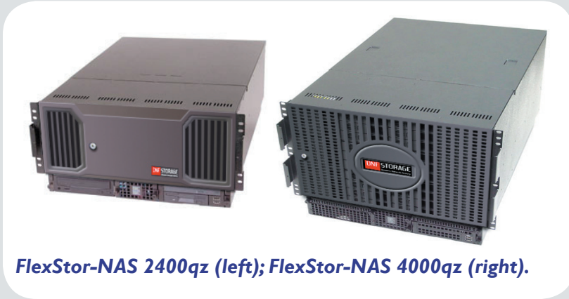
FlexStor-NAS 2400qz (left); FlexStor-NAS 4000qz (right).

Dynamic Network Factory's FlexStor-NAS 2400 and 4000 series file servers are ideal for large high volume environments, data-intensive applications. Each