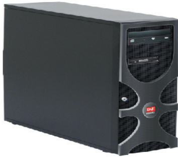
FlexStor-NAS Tower pictured above.

Dynamic Network Factory's small business FlexStor-NAS towers are the foundation of a quiet, high capacity file server solution. Each FlexStor-NAS tower is an efficient solution requiring no racks or server room