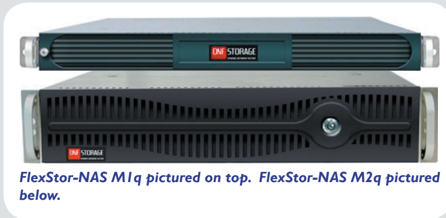
FlexStor-NAS M1q pictured on top. FlexStor-NAS M2q pictured below.

Dynamic Network Factory's modular FlexStor-NAS gateways are the foundation of a modular, flexible and scalable file server solution. Each FlexStor-NAS gateway can be configured to utilize any existing storage resources