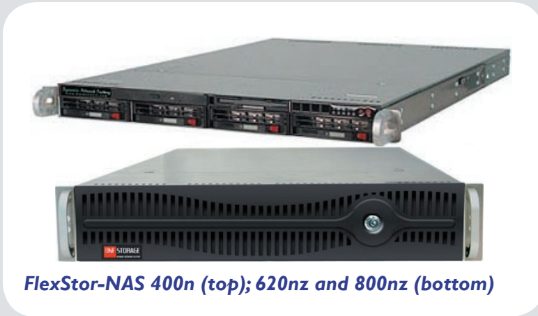
FlexStor-NAS 400n (top); 620nz and 800nz (bottom)

Dynamic Network Factory's FlexStor-NAS WorkGroup Systems are the foundation for data management in small-to-medium sized business. Each FlexStor-NAS WorkGroup system provides scalability and efficiency,